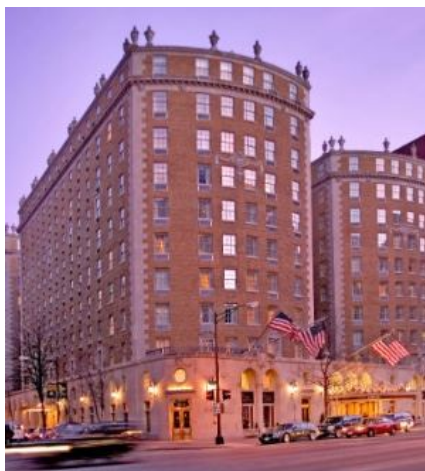
The Mayflower Hotel in Washington, D.C.

Click here to see photos from this event!